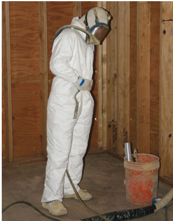
Figure 5. A supplied-air respirator is a must when spraying foam. A layer of clear plastic wrap keeps the face shield clean for repeat use.

Edge treatment. The slab perimeter calls for especially careful work. The greatest heat loss occurs at the edge of a slab, making a thermal break at this juncture critical to good performance. On a standard basement slab, we use one of two details at the perimeter, depending on whether the basement will be finished. If framed and finished walls are planned inside the foundation, we'll roll the foam about 12 inches up the walls (Figure 4, previous page). Since we often return after the framing is completed to insulate the foundation walls, we can simply tie the wall foam in with the slab insulation. The