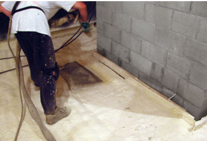
Figure 2. The foam can be walked on only minutes after spraying, permitting multiple layers without significant delay. The 2x4 at this chimney base will be removed after spraying to provide the code-required gap between the flue and the foam.