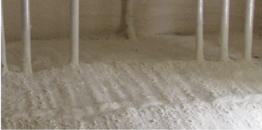
Figure 1. Plumbing penetrations can be tricky to plug with rigid foam board; SPF seals seamlessly around obstacles with a few passes of the spray gun.