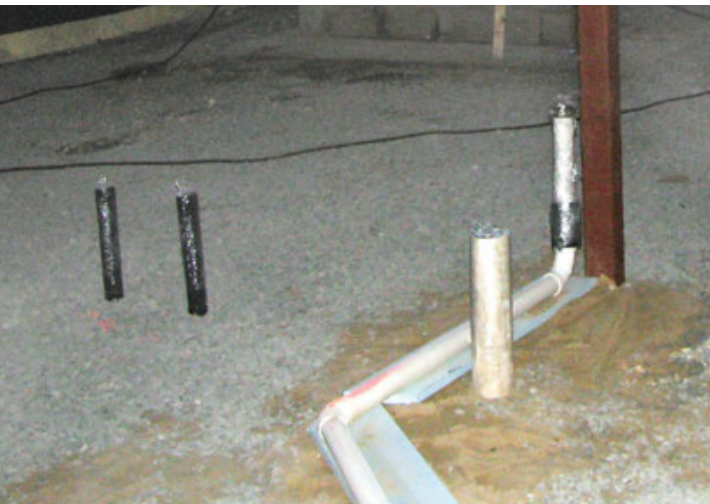
Figure 3. Cured foam sticks tenaciously to most surfaces. Plastic food wrap protects these plumbing stubs from the overspray.

has an R-value of 12 to 14 (again, depending on brand), which is sufficient for most climates. As a rule, R-10 is adequate under most slabs.