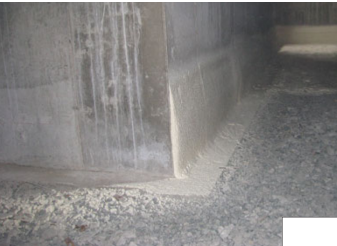
Figure 4. When a finished basement interior is planned, the foam can run up the walls to create a thermal break at the slab edge (left). Drywall furnishes the code-mandated fire protection (top illustration). In an unfinished basement, rigid foam board provides a neat thermal break at the slab's perimeter (bottom illustration). The excess can easily be trimmed flush with the finished slab and sprayed with a thermal barrier coating.

detail foam board around the perimeter and penetrations. On slabs 2,500 square feet and greater, we often reduce our price slightly, which ends up making SPF the less costly route. And because of the time saved, the slab pour can be moved up in the schedule.